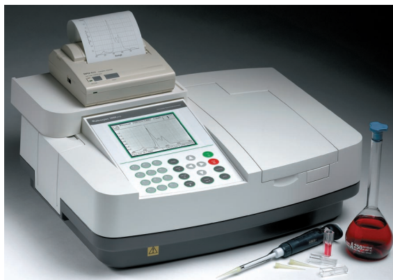
Fig 1. Ultrospec 3000 pro shown with printer and printer stand. This system combines excellent performance and high specification with minimum bench space.

Ultrospec 3000 pro has the performance and incorporated software to comply with the Pharmacopoeia. A bandwidth of 1.8 nm enables high-resolution scanning which is important for assurance of pharmaceutical purity and drug discovery procedures.